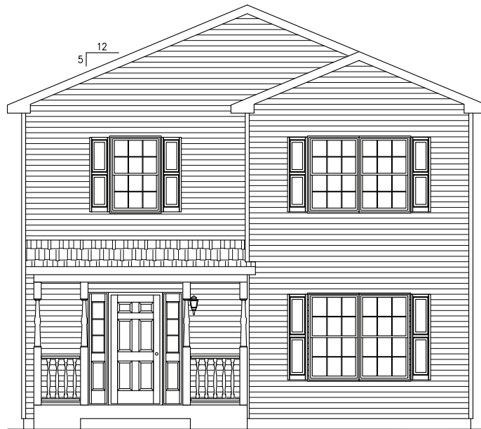
••SHOWN WITH OPTIONAL PORCH AND WINDOW GRILLS••

CHELSEA II 27'-6"x34'-0"/38'-0" TWO STORY (1980 SQ. FT.) 3 Bedroom / 2 1/2 Bath