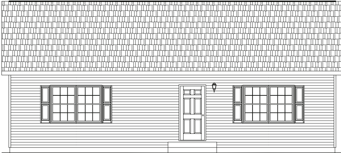
FRONT ELEVATION •SHOWN WITH OPTIONAL WINDOW GRILLES•

HARRISON II 27'-6"x40'-0" RANCH (1100 SQ. FT.) 2 Bedroom / 1 Bath